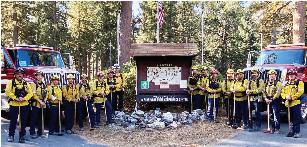
San Bernardino County Strike Team 6231 Charlie saved our Camp

Our dedicated Camp volunteers and staff worked hard this summer to get our fire clearance done. During the El Dorado fire, the valiant San Bernadino County fire fighters worked tirelessly to keep our buildings from burning.