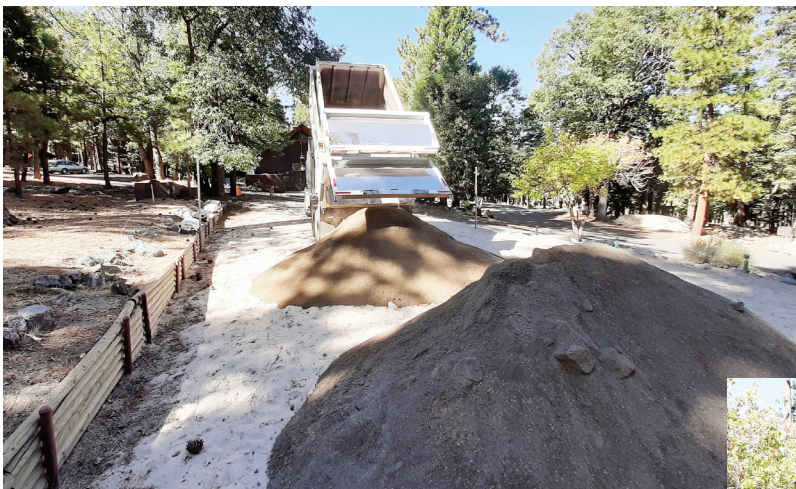
First of 8 loads of sand

To safeguard buildings, we have jumped into “sandbagging” mode quickly. With volunteer effort, we have filled an estimated 9000 sandbags to help direct water away from buildings. Contractors will be hired to set straw wattles, silt curtains, and straw bales on the burned mountainside in an effort to protect the water tanks and wellhead from disappearing un-