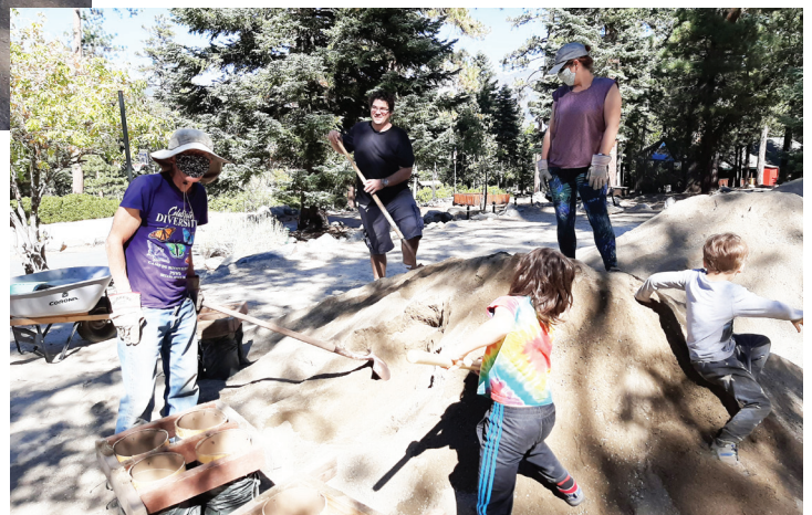
Volunteers of all ages help to fill sandbags

der mud flows. Winter comes earlier up on the mountain, so we need to get this work done very quickly. With the upcoming rains and winter snows, the Highway 38 corridor will be impacted with rocks and mudslides until some plants grow on the slopes. We must put camper and staff safety first as we make decisions about Camp's reopening date.