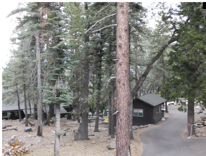
All is quiet at Camp during the pandemic

When the COVID-19 pandemic hit and with due caution, the board of directors elected to cancel all camps for the entire 2020 camping season, with an extension into 2021. This decision, although necessary, resulted in a financial crisis for Camp. Fixed costs run $50,000 per month, so we determined in March to fundraise $600,000 to preserve Camp until we could safely reopen. The COVID-19 Emergency Campaign has raised over half its goal—such great news! And now, the El Dorado Fire has burned right to Camp. Talk about a double whammy. Talk about the need to double down on all fundraising efforts!