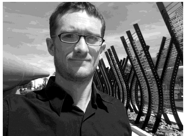
USS Arizona WWII Memorial bearing the names of fallen sailors

With that, I hope to be a better agent for peace in the world, so that no further war memorials must be built in downtown Phoenix either. □