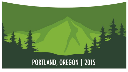
UUA GENERAL ASSEMBLY

Budget will be emailed to members prior to the budget meeting.