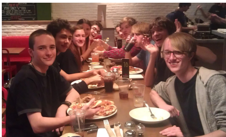
Youth group members enjoy a celebratory lunch

Coming of Age candidates, teachers, mentors and families thank everyone who came out to support our February Cupid's Market fundraiser. The group raised in excess of $800, which will help to fund a special graduation trip at the end of May! Thank you for your love and support—it was a wonderful success!