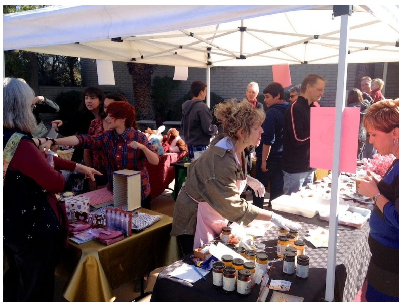
Coming of Age candidates sell Valentine goodies

Coming of Age candidates, teachers, mentors and families thank everyone who came out to support our February Cupid's Market fundraiser. The group raised in excess of $800, which will help to fund a special graduation trip at the end of May! Thank you for your love and support—it was a wonderful success!