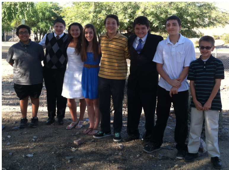
Coming of Age class ready for Quaker Meeting on November 18 th .

Some of you may be called upon to take part in an interview process with one or more of our COA students, and we ask you to please share honestly. Our youth are charged with interviewing six members of the congregation, with questions about the nature of God, life and death, religious