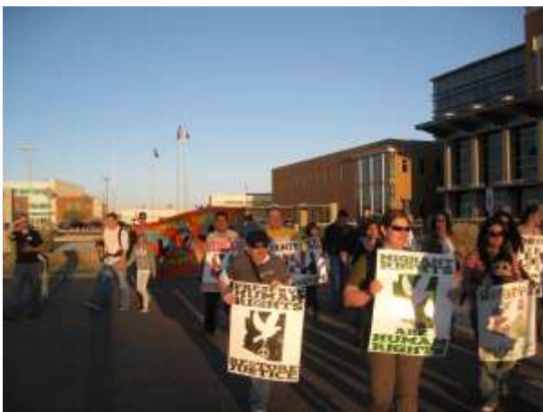
Vigil at Pinal County Jail, an ICE contract detention facility.