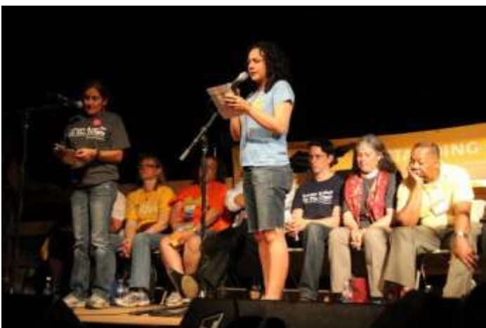
Justice GA Tent City Vigil. Speaking names of those who have died in ICE Custody.

Justice GA's closing celebration on Sunday, June 24, 2012 ended with the strains of "From this House...to the World, We Will Go, Hand in Hand." Now Justice GA is a part of the legacy of UUs throughout the world--especially of UUCP and other Arizona congregations.