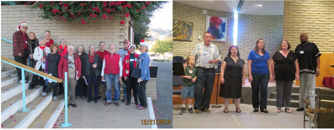
Outreach Music Ministry