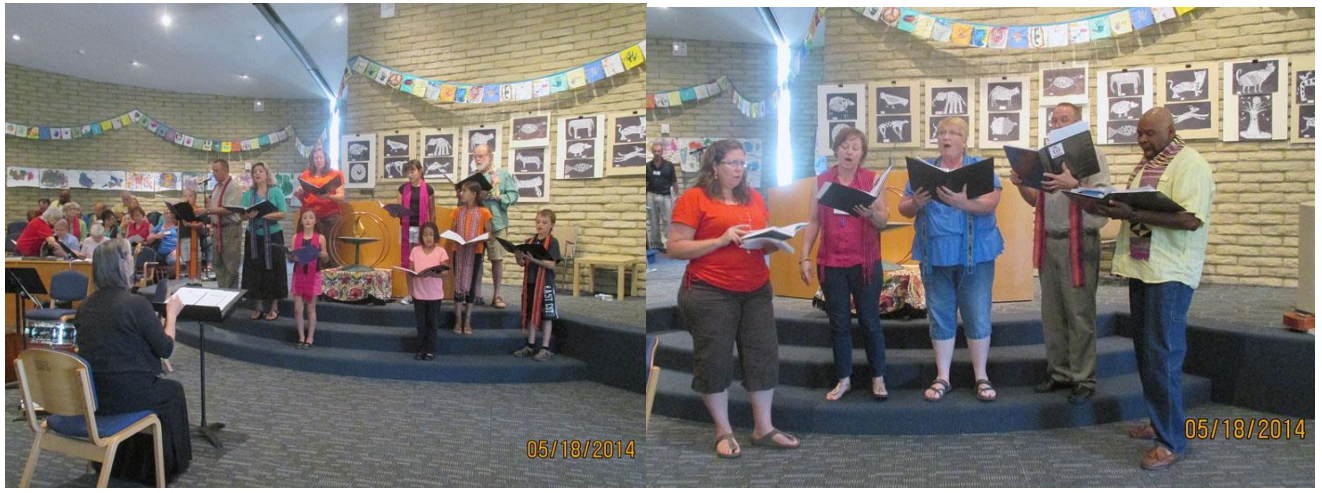
Family Choir Performance