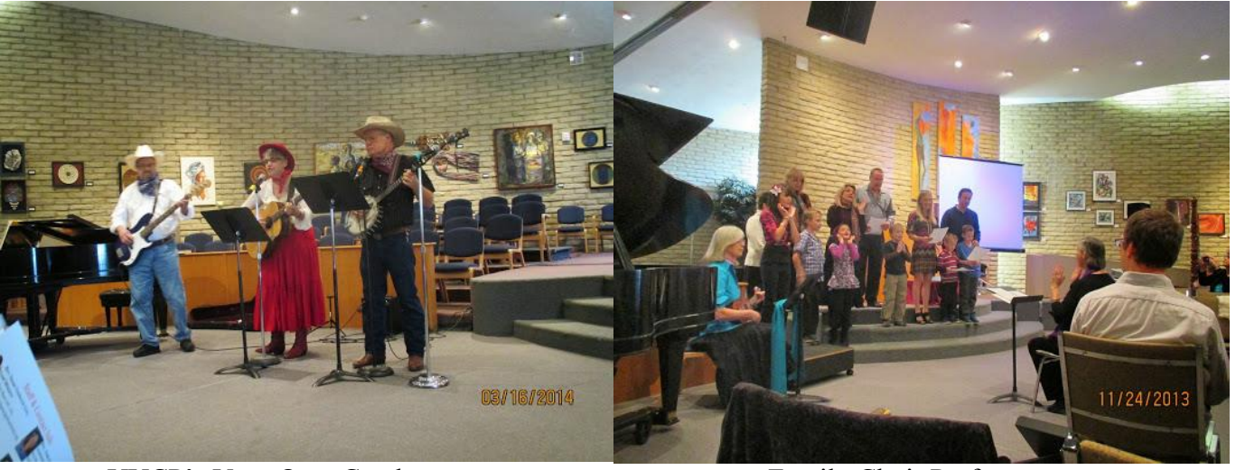
UUCP's Very Own Cowboys