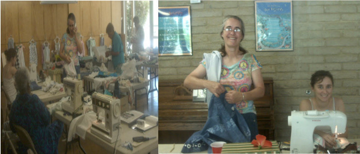
The group at Lori's