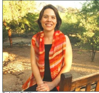
The Arizona Republic