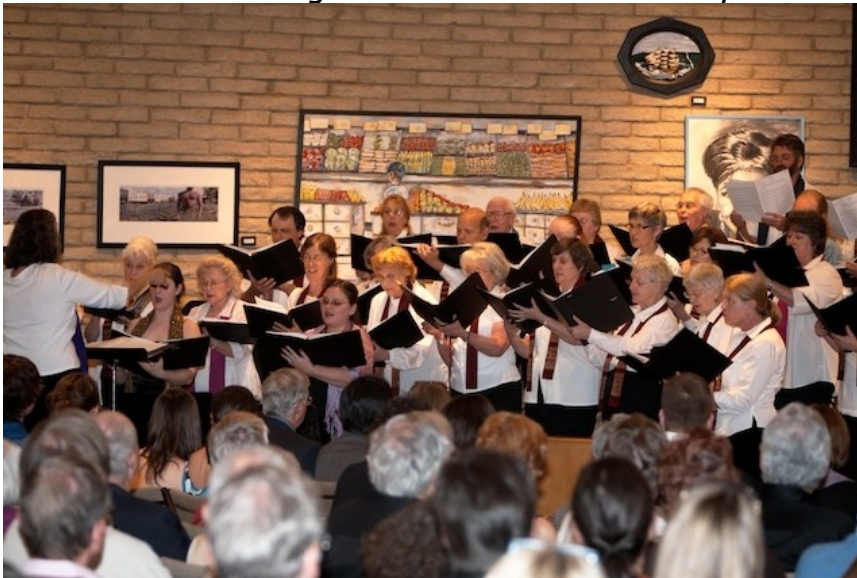
Exhibit A. Choir Sings for Susan Frederick-Gray's Installation on January 25, 2009